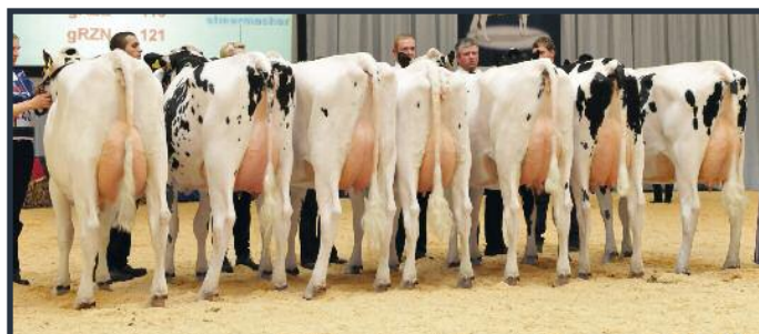
Samburu daughter group at the show Blickpunkt Rind

Frosko presented himself as a production sire that transmits good feet & legs and functional udders. Roumo , having an interesting combination of milk yield and components, had a group of functional young cows with lots of strength, correct rumps and faultless feet & legs. Elburn RC whose sons dominate the genomic lists proved his sire qualities. His harmonic daughters excelled with their