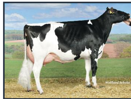
Elburn RC daughter Indiana

Besides the very good cows at the show, the four progeny groups presented were well-received by the visitors. The second crop daughters of Toscano and Van Gogh were viewed with mixed emotions since these two excellent sires unfortunately passed away