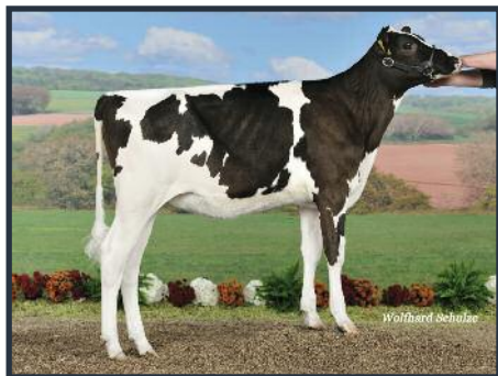
Gold-Red daughter Golan

popular bull Samburu were from second crop as well. They presented themselves uniformly as trouble-free, strong cows without any faults. Daughters from the test period of the production sire Bazuli were shown. They had lots of strength and body depth as well as udders that are milked easily. Moreover, young daughters of the genomic bull Gold-Red were presented. They had very good conformation and could be shown in both breeds due to the VRC gene of Gold-Red.